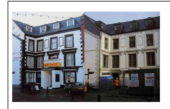
Appendix 3 Further case studies of HLF-funded projects which support town centre regeneration.